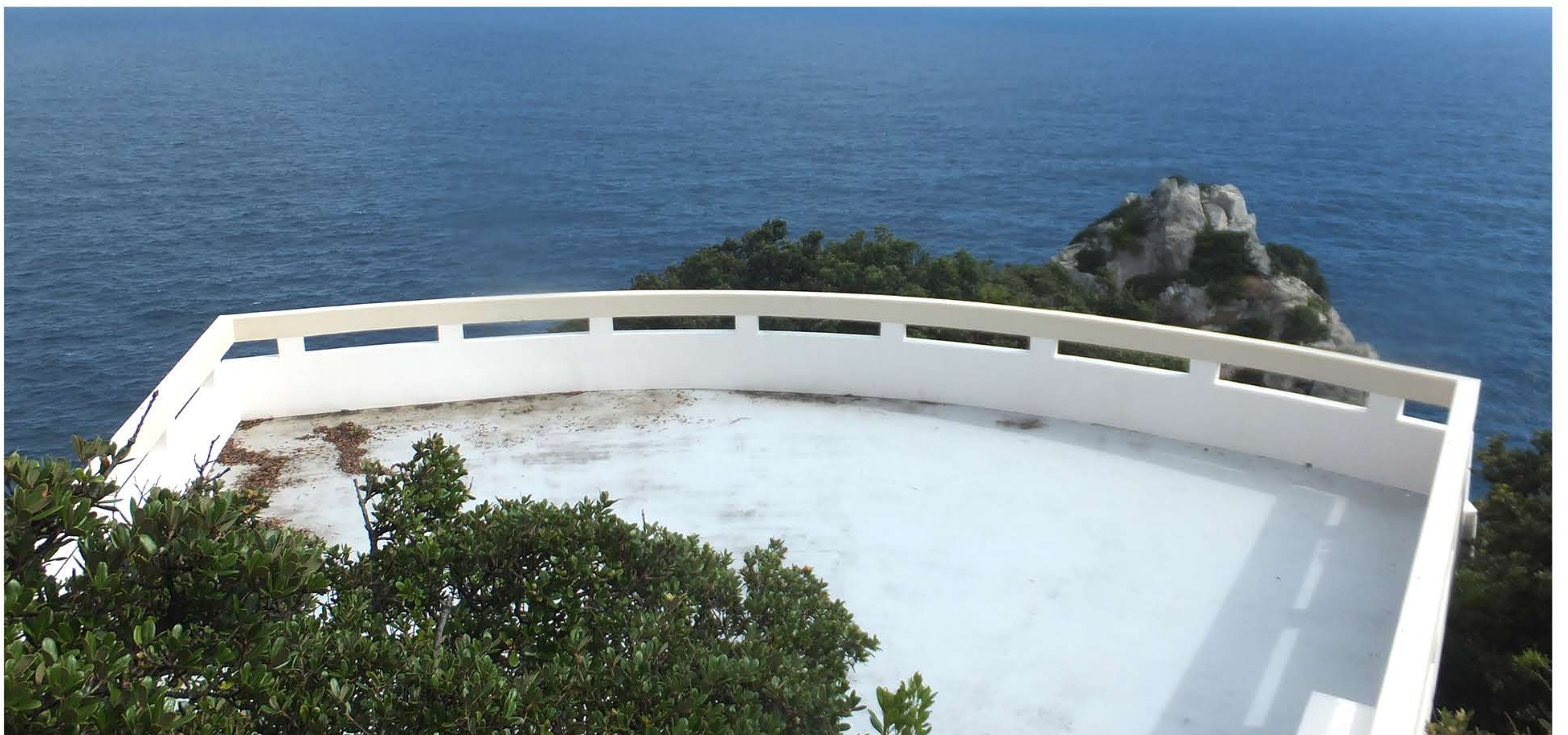
*Turning right at the top of the stairs that lead up from the Kannon Rock carpark, will take you to the observatory deck.