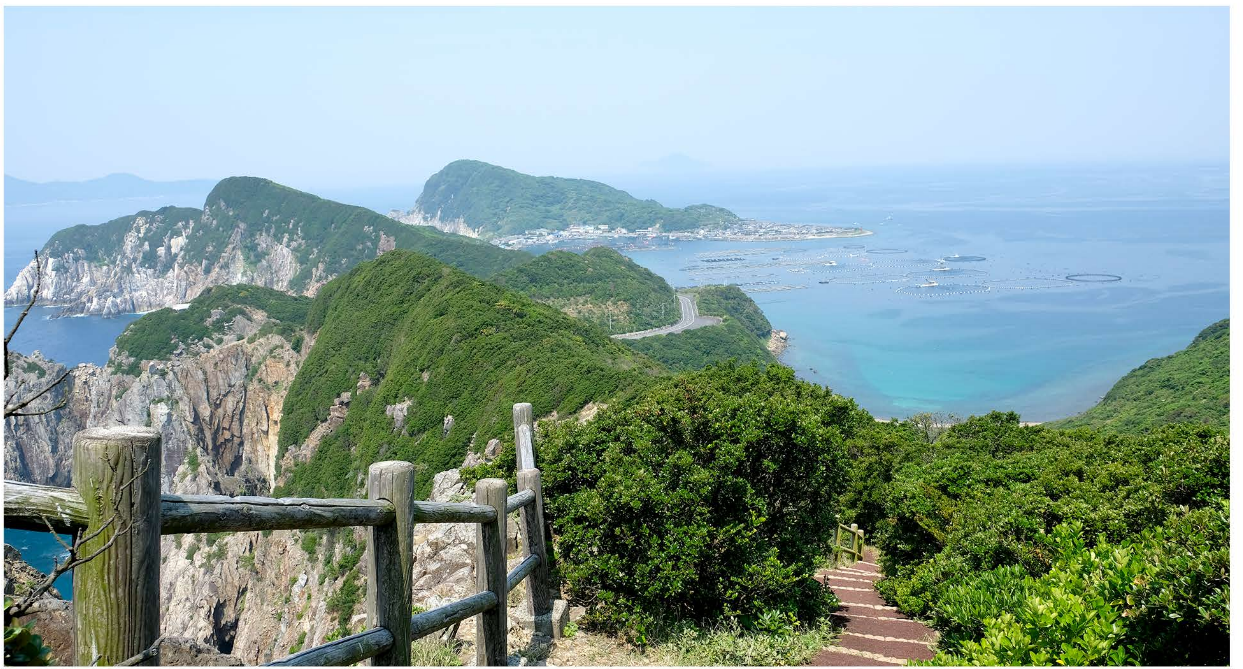
This is the view from the turn around point.