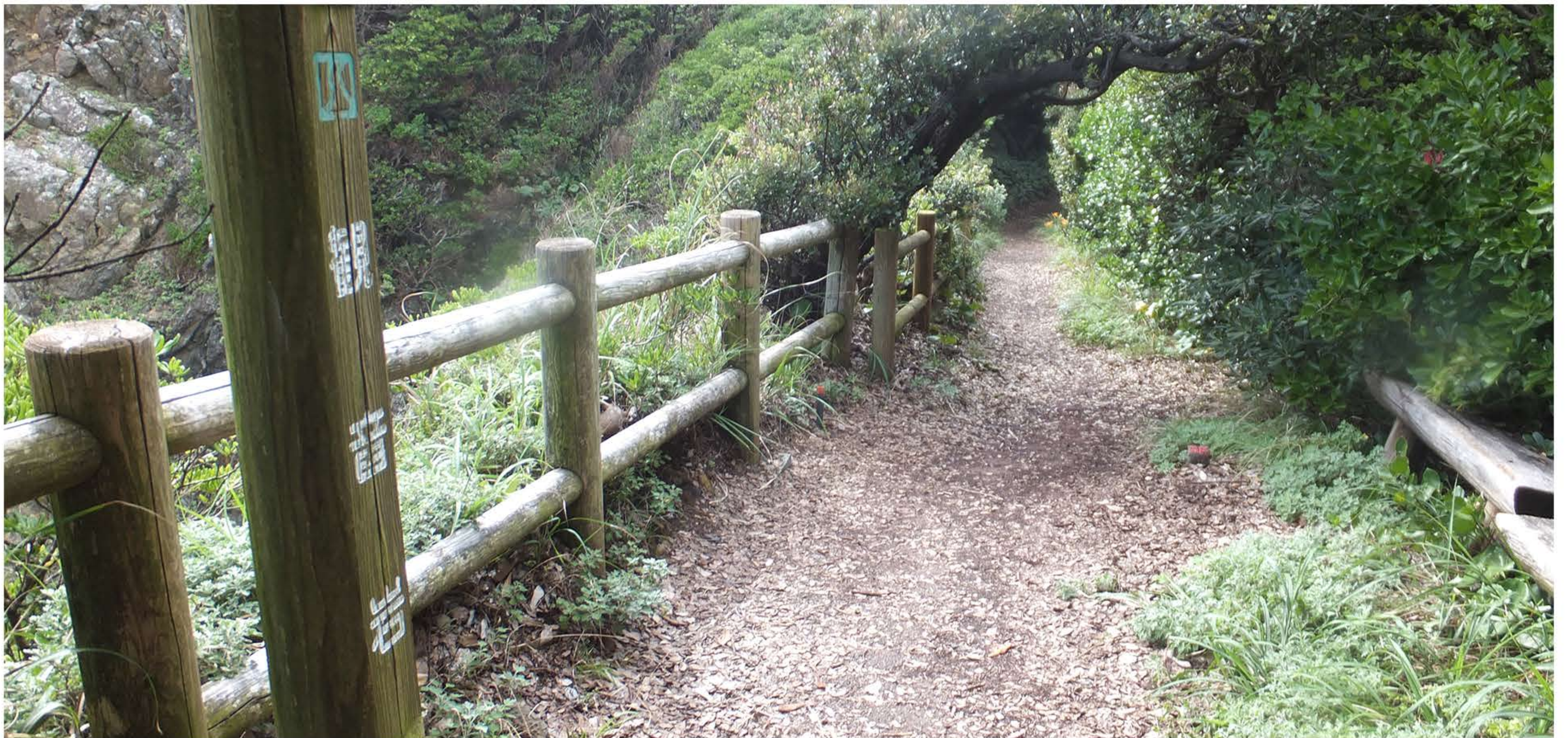
On your return, Kannon Rock (観音岩) will be on your left